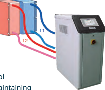
Dual Zone Simplicity